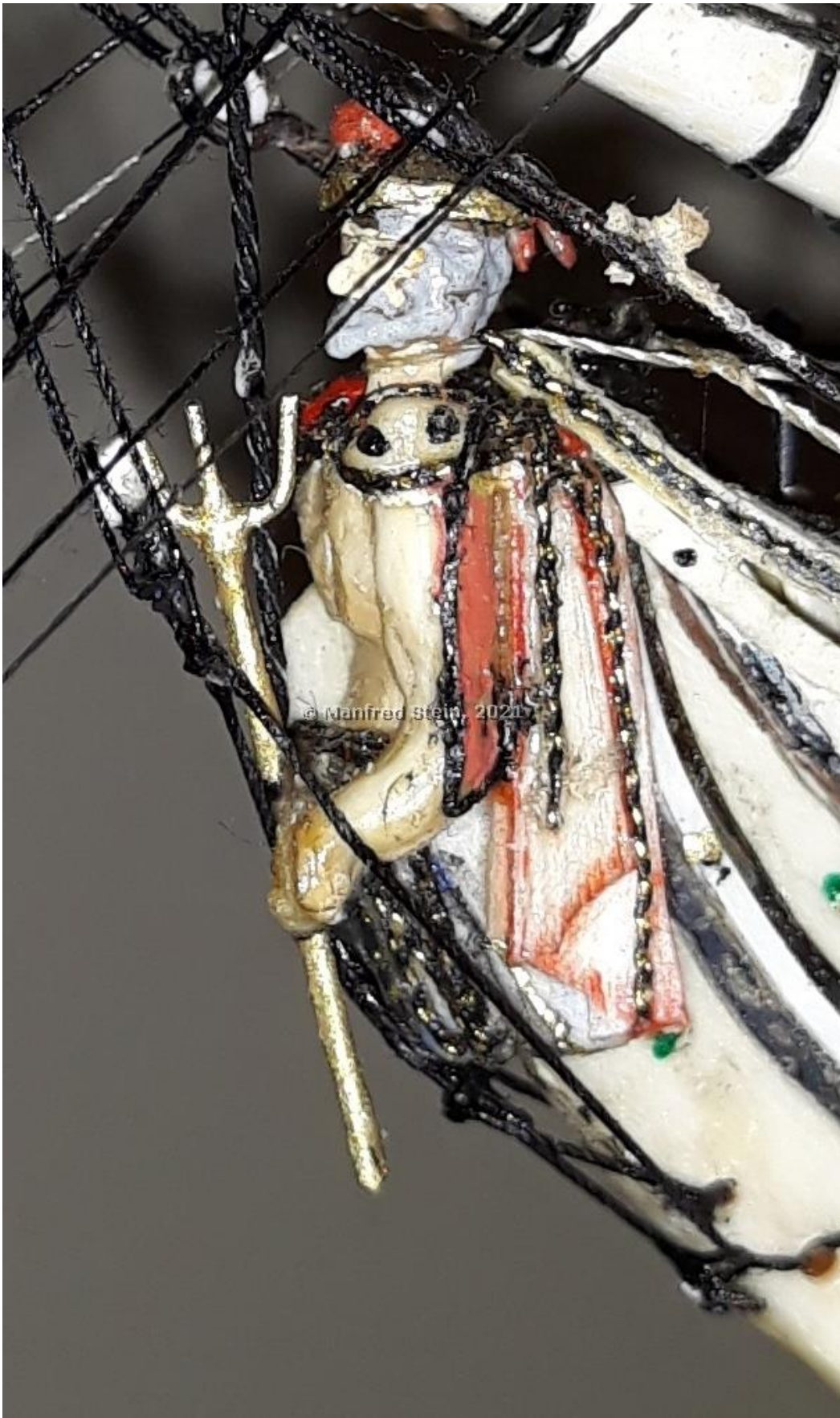
Figurehead of Neptun